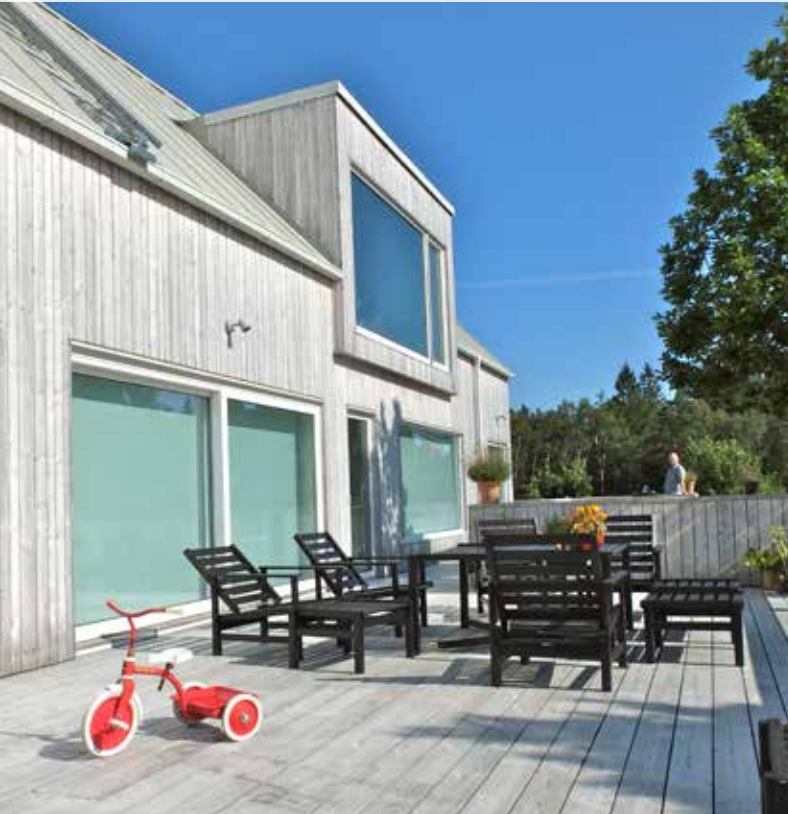
SIOO impregnated spruce. Karlsson Wachenfeldt Architects.