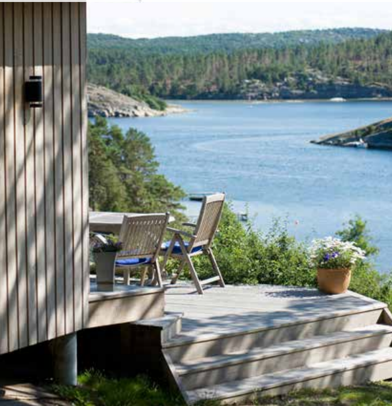
Larch panel, teak furniture. Uddevalla, Sweden.